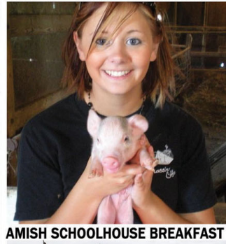
AMISH SCHOOLHOUSE BREAKFAST