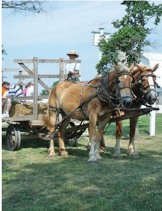
FARM & BARN TOURS